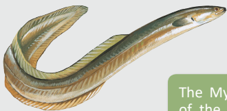
American Eel ( Anguilla rostrata )

American Eels spawn and hatch in the Sargasso Sea, and ascend streams to mature in freshwater.